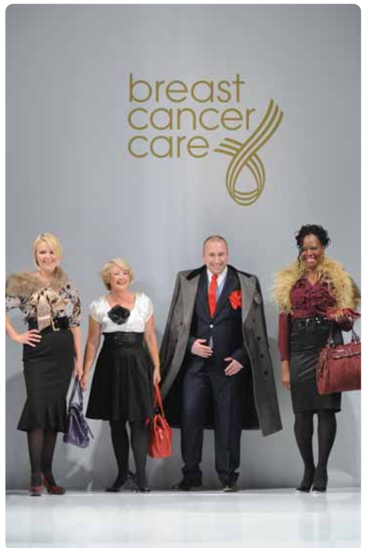
Looking good, feeling confident: some of our real-life models take to the catwalk at the 2008 Breast Cancer Care Fashion Show

We produce a wide range of publications providing information for anyone affected by breast cancer. All of our publications are regularly reviewed by healthcare professionals and people affected by breast cancer. You can order our publications by using our order form, which can be requested from our helpline. All our publications can also be downloaded from our website.